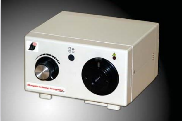
LO50 is the first LED light source more powerful than Halogen.

* -Specifications subject to change without notice